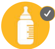
Special needs items

for infants, elderly and disabled family members