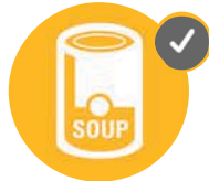
Three day supply of non-perishable food

at least 12 litres per person to last three days