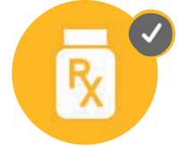
Extra prescription medications