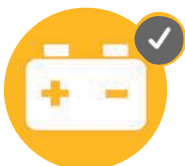
Backup portable charger for cell phone